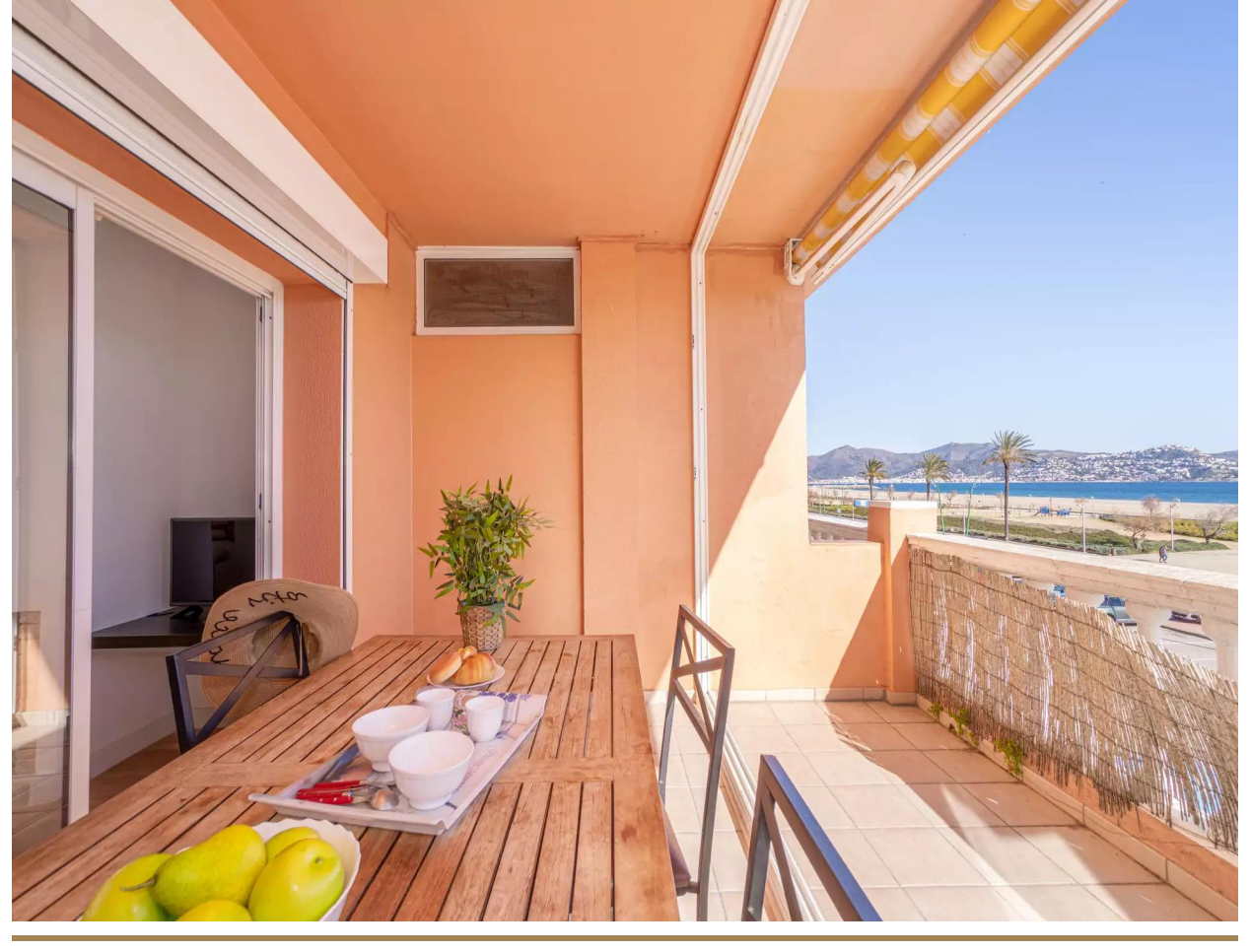
Goertz und Partner 2021 S.L.U. B-02834166

Teléfono +34 972 45 28 76 - E-mail: nb@goertzundpartner.com Club Nàutic Puerto · Edif. Nausica A - Poblat Típic - 17487 Empuriabrava (Girona)